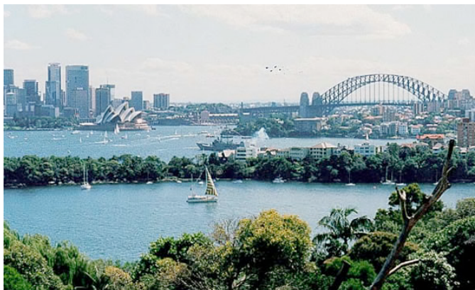
Sydney: the harbor and the Opera