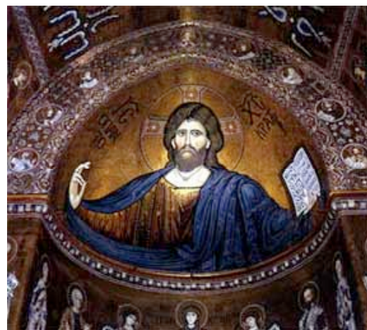
Monreale: the apse of the Cathedral and the mosaic of the Savior